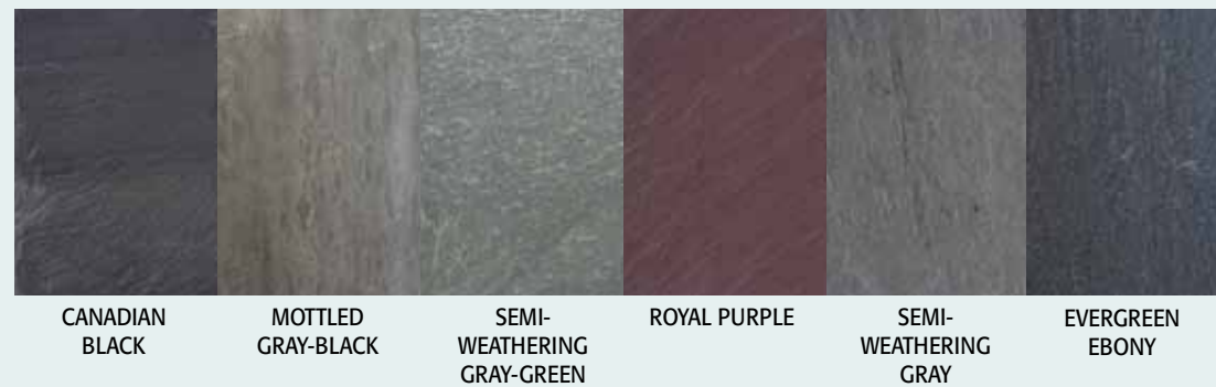
CANADIAN BLACK MOTTLED GRAY-BLACK SEMI-WEATHERING GRAY-GREEN ROYAL PURPLE SEMI-WEATHERING GRAY EVERGREEN EBONY