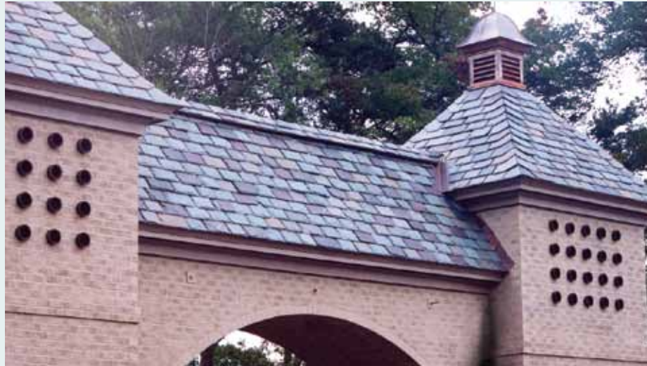
MURR & LANEY

Vermont Natural Slate colors, sizes and texture afford many architectural effects, contributing to the appearance and beauty of any building.